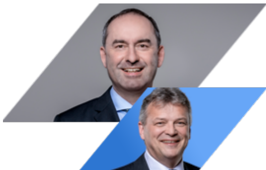
State Minister Hubert