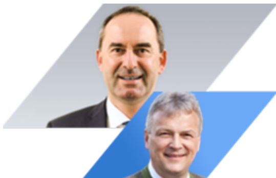
State Minister Hubert